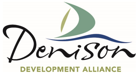
EXHIBIT I ITEMIZED SUMMARY OF MARKETING EXPENSES October 1, 2019 – September 30, 2020